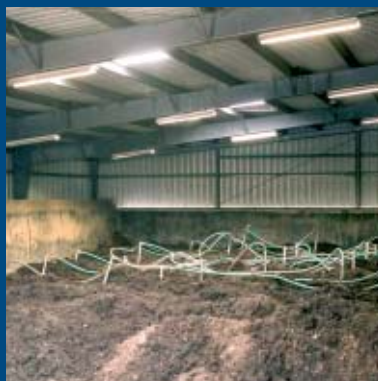
Sufficient oxygen supply for on-site and off-site biological treatment processes is guaranteed by regular soil mixing. Contaminated soil vapour is removed by lances.