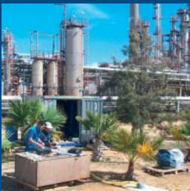
BAUER Environment Group groundwater and soil vapour treatment plants are continuously optimised and maintained by our engineers all over Europe.

The availability of our plants is guaranteed by automatic operation control and alarm systems. Our service personnel is employed in many European countries to support our clients. Remediation plants by BAUER Environment Group are build modular and mobile. They can be leased or bought. Plants by Bauer Environment Group are operated all over Europe.