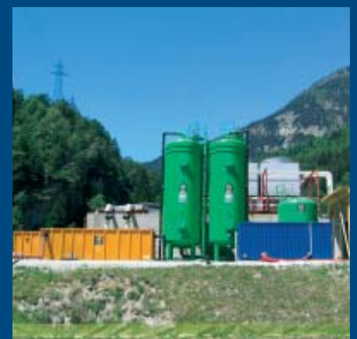
Tunnelling water produced during the construction of the Gotthard Base Tunnel in Faido, Switzerland poses a special challenge. The nitrite contaminated water has to be treated by several treatment stages.