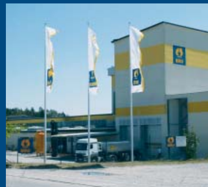
The soil treatment centre Schrobenhausen is one of three treatment centres of the BAUER Environment Group in Germany.