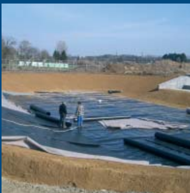
The installation of the sealing foil for bio retention filters takes place under well defined circumstances. Temperatures have to be over 5 °C and the humidity has to be below 80%.

PURE-Products are characterised by the use of special plants and drainage systems developed by Bauer Environment Group and special construction techniques. These systems are improved continuously due to our field experience.