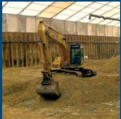
Demolition and Excavation including treatment or disposal of contaminated material are some of the activities of BAUER Environment Group whilst carrying out complex projects