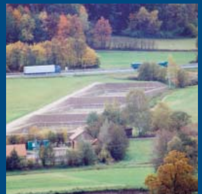
PURE-Sewage Sludge Treatment in Geiselwind was built in terraces, thus the natural potential gradient is used.