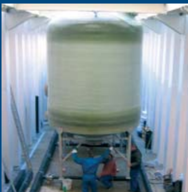
The world's biggest funnel and gate system was built by BAUER Environment Group in Munich. Therefore activated carbon containers (16m 2 ) were installed in the four gates in the 1,2 km long funnel.