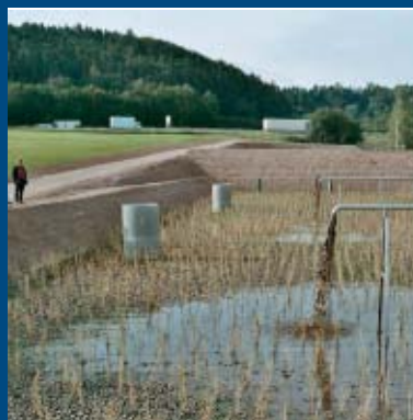
For the ideal operation of a PURE-Sewage Sludge Treatment the sludge has to be uniformly distributed. Distribution takes place through a adjustable PURE-Delivery System.