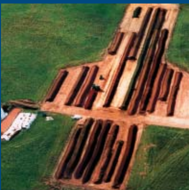
On-site and in situ soil treatment techniques are often cost-saving options facing off-site treatment or disposal.

BAUER Environment Group is a certified waste management facility. We are your partner for the design of disposal concepts and the realisation of remediation projects.